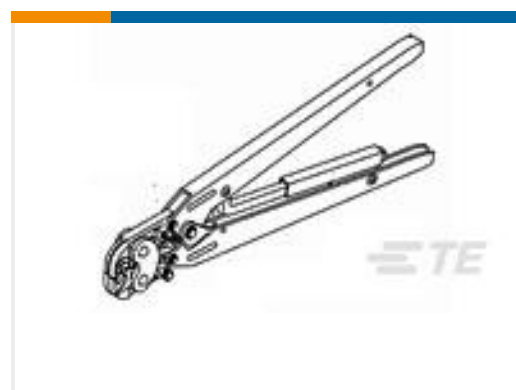
TE Part # 724639-1 DAHT CONTACT-DRAWER CONN 18-14 ASSY