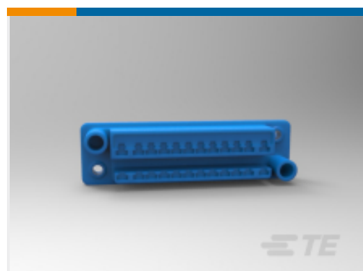
TE Part # CAT-AM7017-SD292P Standard Drawer Plug Housings