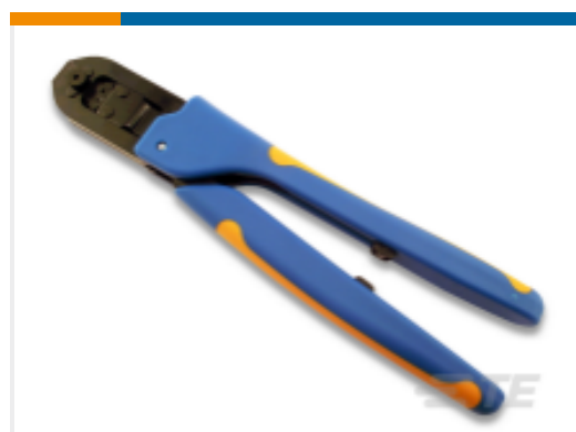
TE Part # 2063849-1 CCII DRAWER CONN 18-14 ASSY