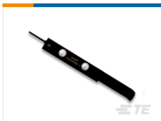
TE Part # 723986-1 EXTRACTION TOOL